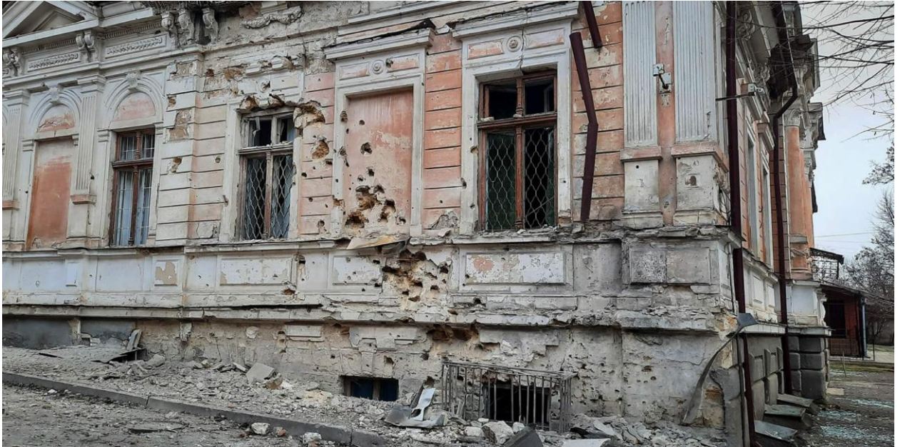
Photo: Building of the State Archive of Kherson Region following Russian shelling on the night of February 3, 2023.