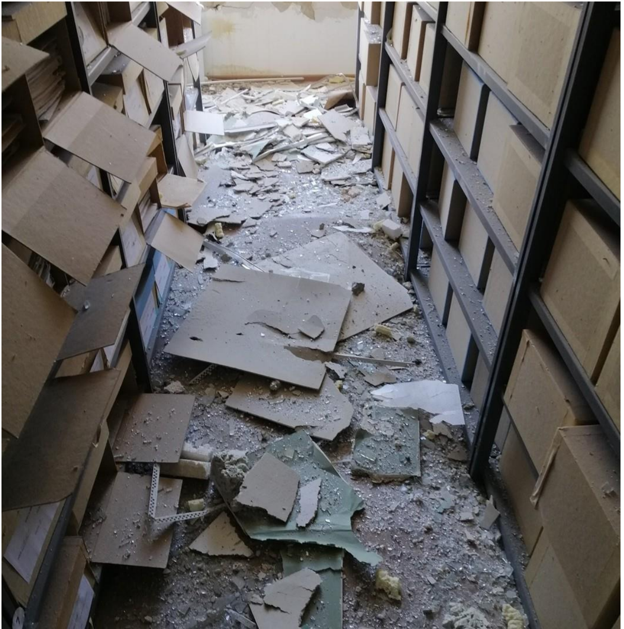
Photo: The aftermath of shelling in the archival department of the Chuhuiv District State Administration, Kharkiv Region.